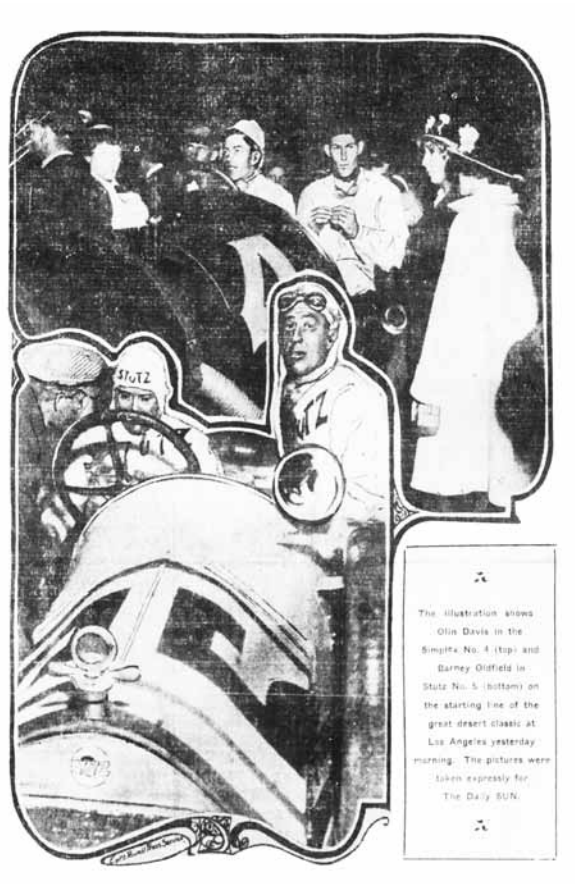
The San Bernardino County Sun (San Bernardino, CA) - Tuesday, November 10, 1914

Conventional wisdom suggested that only reinforced stock cars had the sturdiness to survive the potholes, boulders and river beds the course presented. The experts felt the Stutz was better suited to smooth surfaces like the state-of-the-art brick track at Indy and would collapse before the end of the first leg of this backbreaking, machine-busting gauntlet nicknamed "The Cactus Derby."